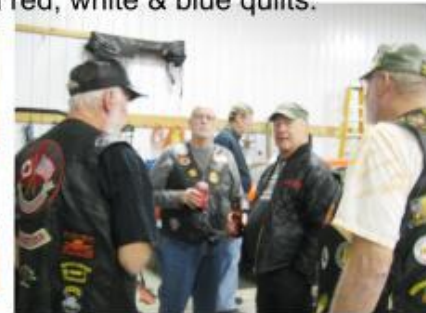
Lots of stories about back then.