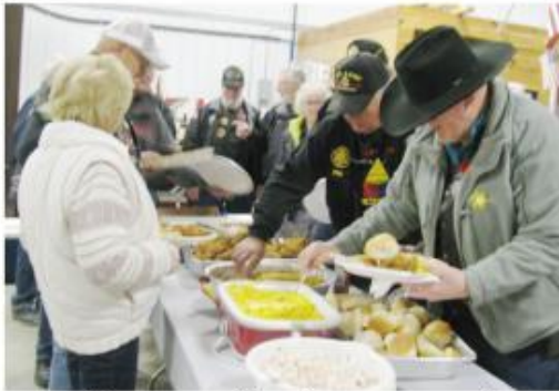
Very good food was served.