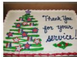
Cake for dessert Thank you all for your service!

Each issue of the newsletter is downloaded to our website nesdvva.org for a copy in full color.