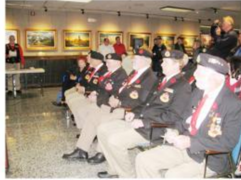
Our Canadian Vietnam Vets.