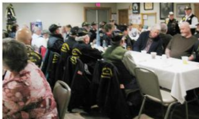
Well attended party and fun.....