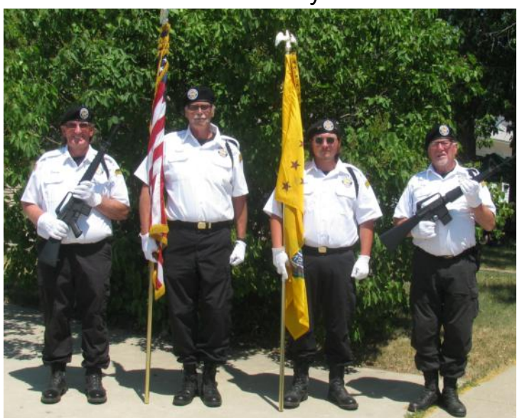
VVA Color Guard in July 4th Parade

The Watertown July 4th Parade hosted 4 color guard units. The VFW started the parade out, followed by the American Legion, then the Marine Corp League and the last group was the Vietnam Veterans.