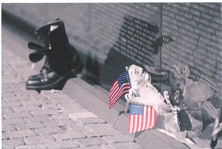
"These Colors Don't Run" by Gene Castellano