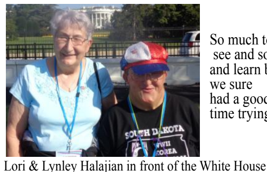
So much to see and so and learn but we sure had a good time trying.