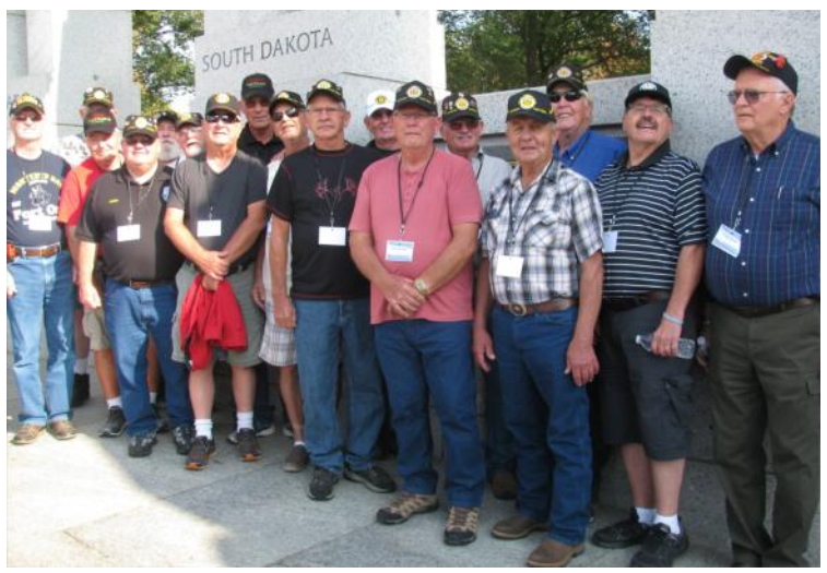
We visited the WWII Memorial and found the South Dakota Pillar.