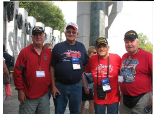
Another honor flight from Illinois at WWII Memorial