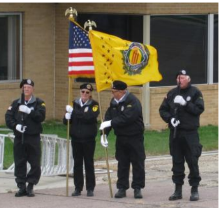
Color Guard from 1054 awaited us at the airport.

Several groups of friends were together. While several knew each other before we left, all knew each other when we returned.