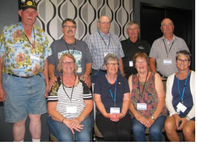
A friendly group from western Minnesota

Each issue of the newsletter is downloaded to our website nesdvva.org for a copy in full color.