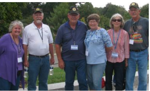
Solberg's, Scheller's & Tarbox