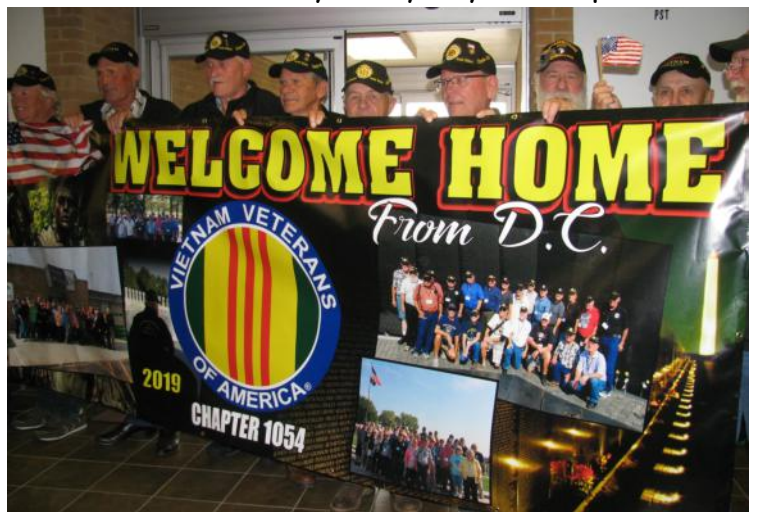
When we arrived home to Watertown we were welcomed by our Chapter, friends, relatives, community members and government officials.

Each issue of the newsletter is downloaded to our website nesdvva.org for a copy in full color.