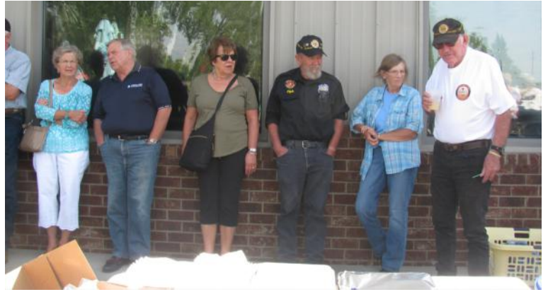
Just waiting for the food to get ready....