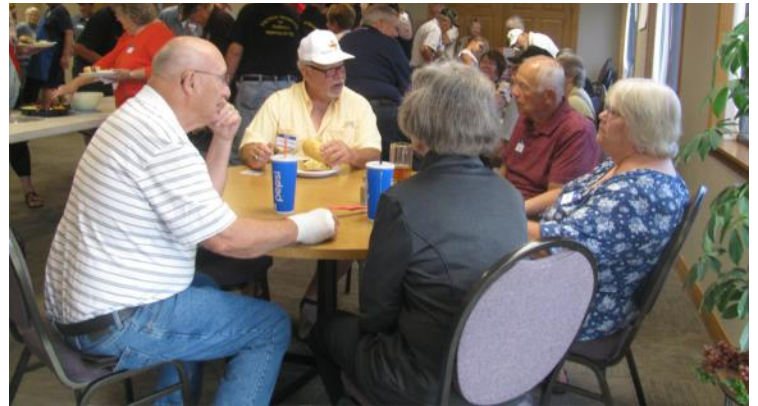
Lots of Veterans from Watertown and the surrounding area attended.