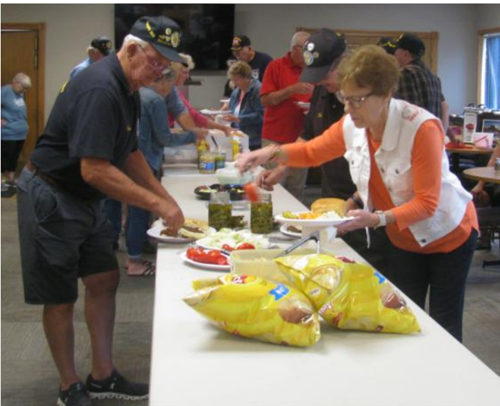
Great food.....brats and hamburgers, salads and chips. We chose to eat inside without the flesh being invited.