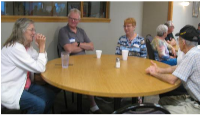
Best thing about picnics besides the food is visiting with our friends we have gained through our organization.