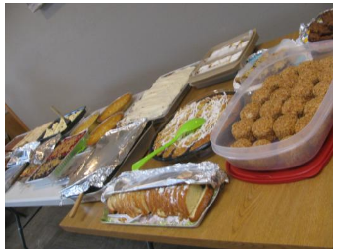
Several of the wives brought desserts and of course they didn't disappoint. Yes you could go back for seconds and many we saw did.....