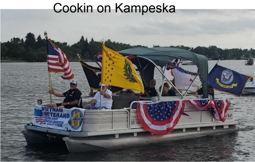
Cookin on Kampeska