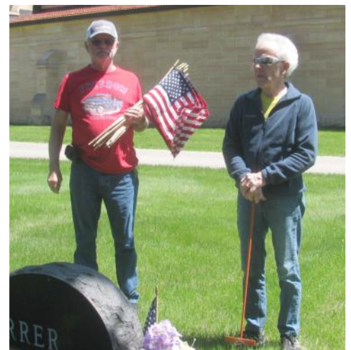
Clean up crew at the VFW before putting them away until next year.