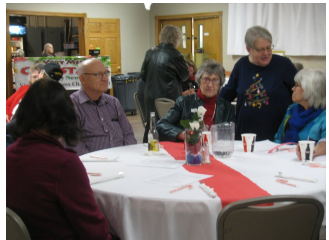
Members for several communities came out on our cold blowy night.