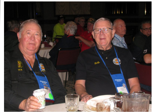
Time to eat again!