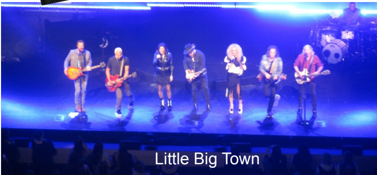
Little Big Town