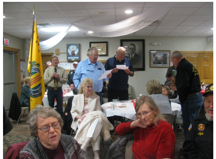
We always have fun singing the Armed Forces Medley song.....

Each issue of the newsletter is downloaded to our website nesdvva.org for a copy in full color.