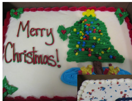
We bought a Merry Christmas cake and a Congratulation Chapter 1054 cake for dessert.