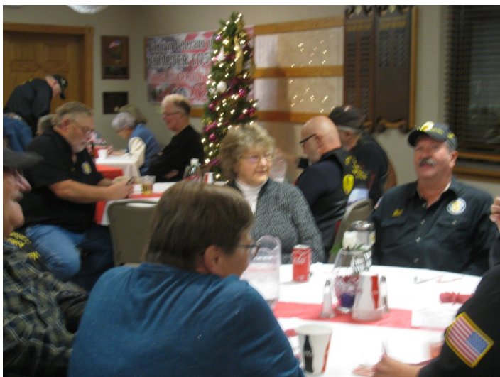
Lots of fellowship before with Veterans and spouses.