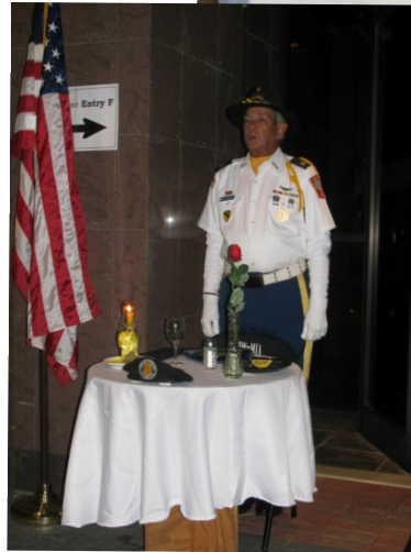
A solemn ceremony