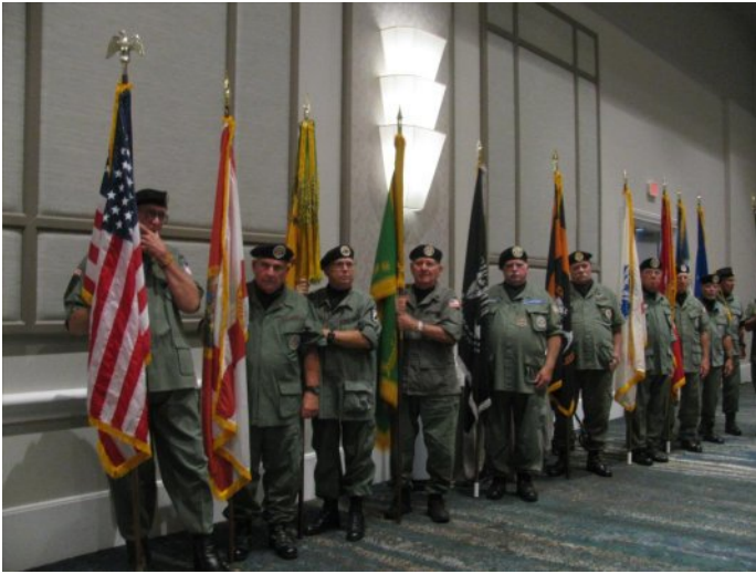
The National VVA Convention kicked off on Wednesday with the color guard presenting colors and also flags for each branch of the service. The National Anthem was presented and speakers presented programs that were available for the Veterans, both health and other services.