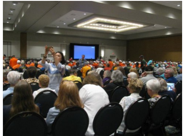
More than 750 Veterans and a couple hundred AVVA members were present to find out what was the future of the organization and to hear what programs existed and were to be available for the Veterans.