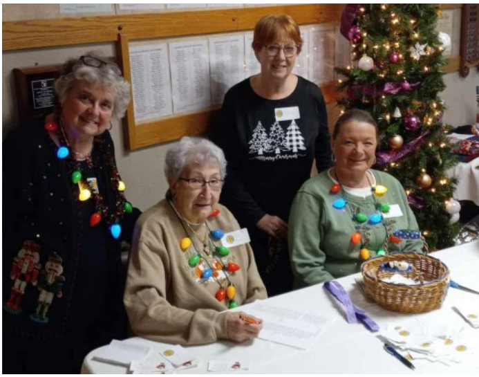
2023 Christmas Party held at the Elk's Lodge on Saturday December 2nd. 50 members and guests attended!