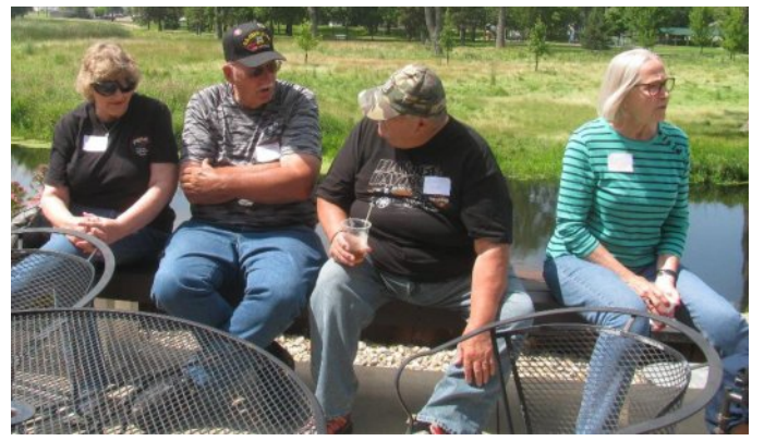
Besides great food, we get to visits with great Veterans.