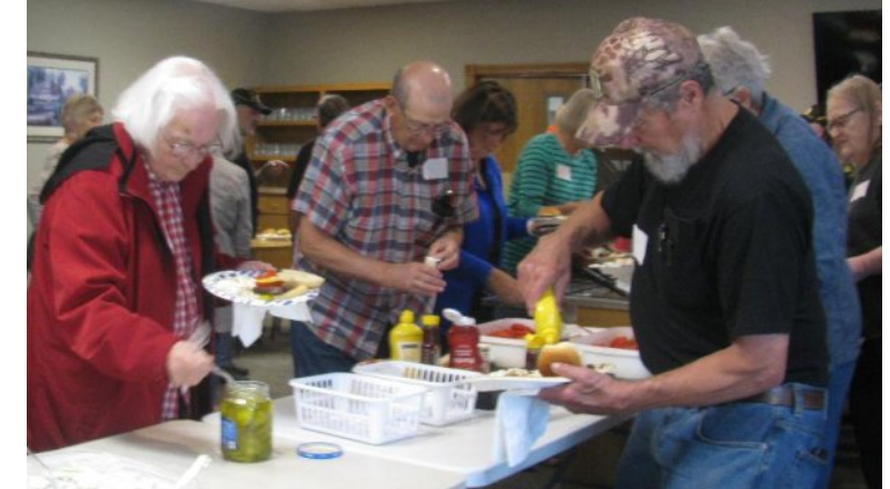
Great brats, hamburger and hot dogs from Jorgenson Meats in Waubay.